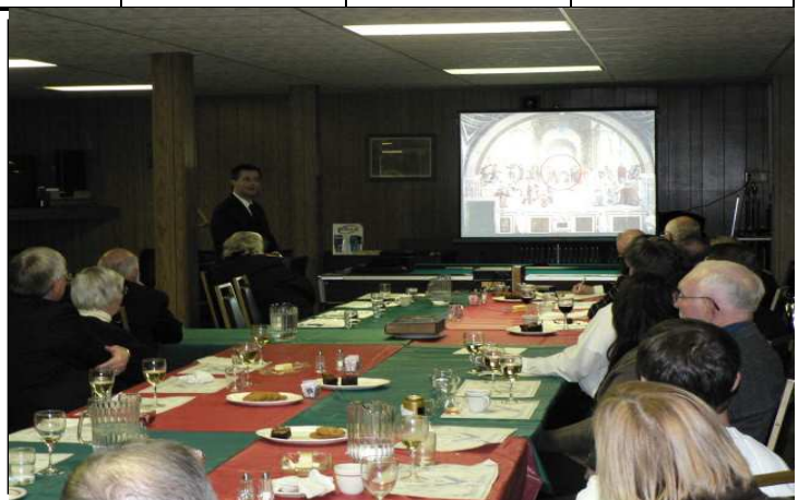
Photo At Right: Sir Knights and Guests at 2009 Christmas Observance